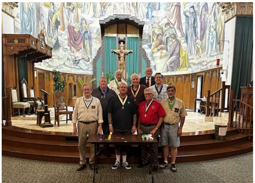
Installation of officers for Saint Thomas Aquinas Cathedral Parish Council 978.