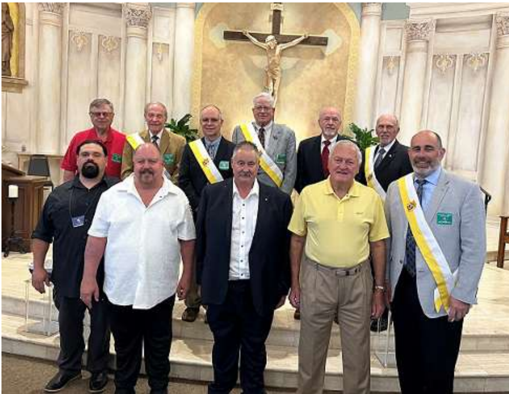
Exemplification on June 29 at Msgr. Patrick J. Connors Council 4997.